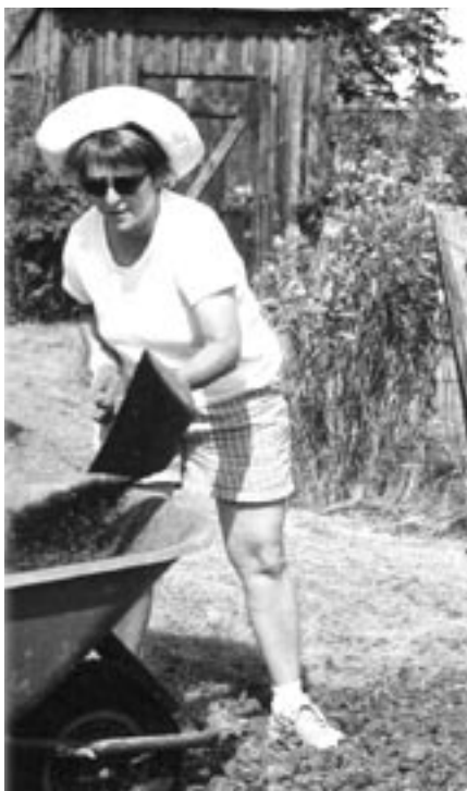
Craigflower Community Garden

There are two gardens in James Bay – one on Michigan Street near the Lifecycles offices and the other on Montreal Street between Oswego and Niagra. The Michigan Street garden has 20 plots and the Montreal garden has 54 plots. Both gardens are very