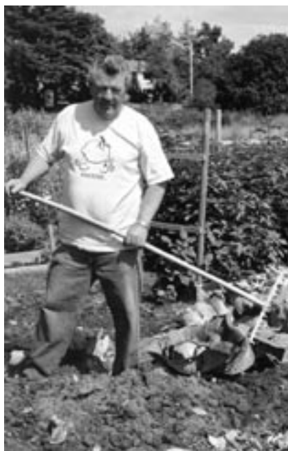
Agnes Street Allotment Garden

Saanich contains the most plots, meaning its gardens tend to be larger and serve more gardeners, while Victoria has the largest number of gardens, meaning there are more locations to garden. All of the gardens depend upon money raised through the fees charged to gardeners, and most are organized and administered by volunteers.