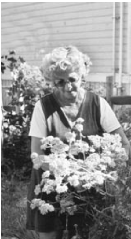
Michigan Street Garden

Langford's community garden is located in Willing Park, a site that was created in 1998 with assistance from Youth Services Canada. Although the